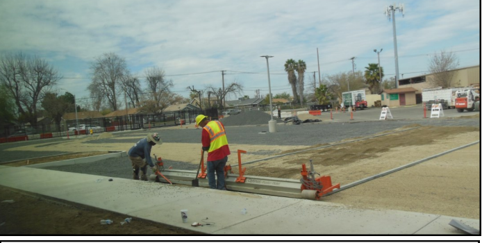
North employee parking lot under construction. See next page for the final result!