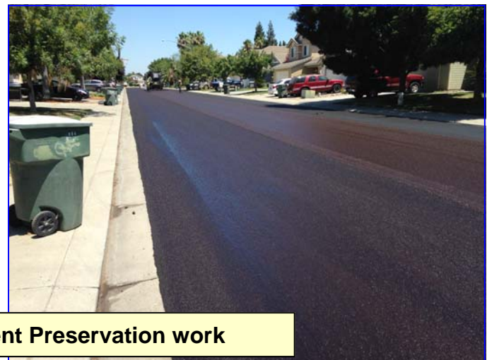
Salida Pavement Preservation work