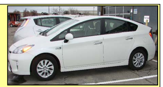
Public Works' 2015 Toyota

Slowly with key in hand, I approached it with curiosity. As its blizzard pearl exterior glistened in the sun, a silver emblem on the tailgate caught my eye. Mesmerized by the word Synergy, I quickly jumped back from the 4,090 lbs. (GVW) beast. What is that noise? It unlocked itself, what? I didn't touch it. I slid into the driver's seat cautiously. Pushing the start button, it hummed. A screen on top of the dash flashed a "Welcome to Prius" logo.