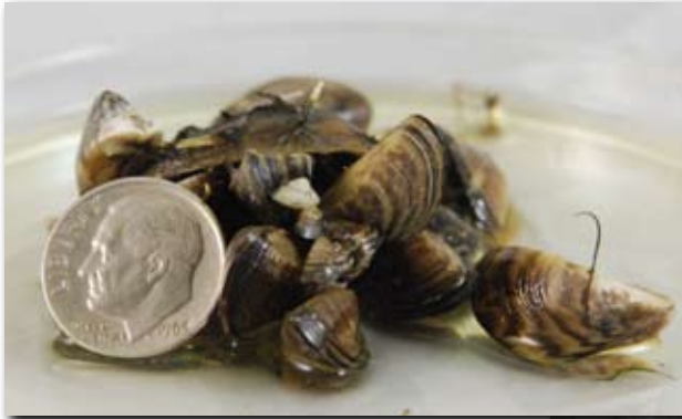
Zebra mussels next to dime.

Quagga/Zebra mussels vary in color and often have dark and light stripes on their shells. They differ in size, from microscopic young to adults an inch or two in length. These invasive mussels cluster in huge colonies.