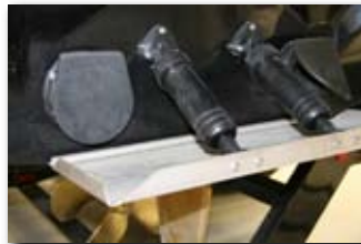
Trim tabs on transom.

Follow these actions to stop mussels from growing inside the entire system. Failure to do so could result in restriction of water lines, overheating and pump damage, as well as the increased likelihood of needing to replace expensive system components.