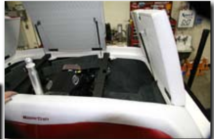
Ski boat covers open.