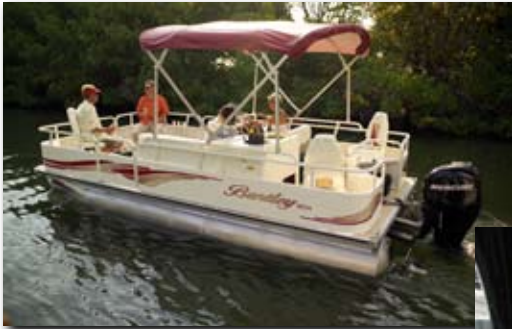
Southern California Marine Association

All areas that can hold water should be drained and dried. Pontoons should be inspected for mussels, settlers, and aquatic weeds that may have mussels attached.