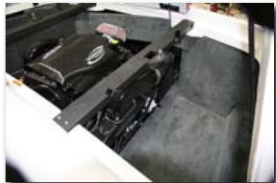
Ski boat ballast water lines.