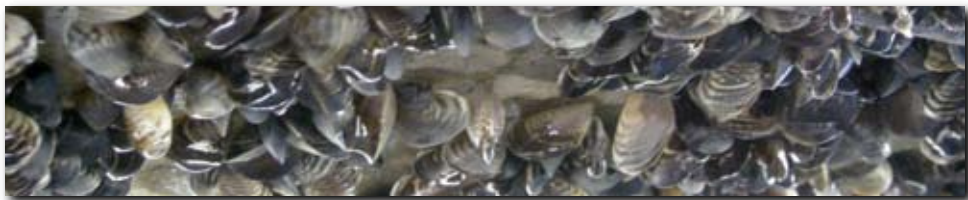
Quagga mussels on boat hull found at California Border Protection Station.

Failure to clean your vessel can result in it being quarantined.