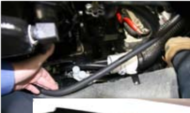
Ballast system water pump, water lines, and caps should all be flushed and cleaned.