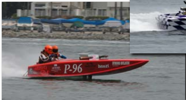
Don't Move a Mussel!