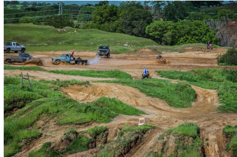
La Grange OHV