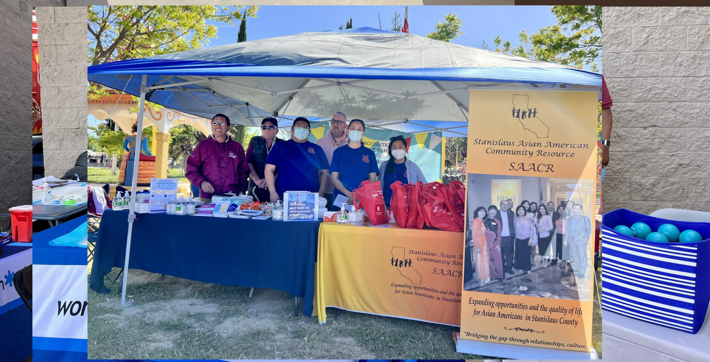
SAACR Covid-19 Outreach at the Cambodian New Year