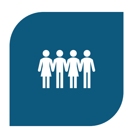
Embedded Community Model