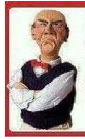
Two men knocked on my front door today and asked if I would kindly donate to the new, local swimming pool that is being built - so I gave them a bottle of water.