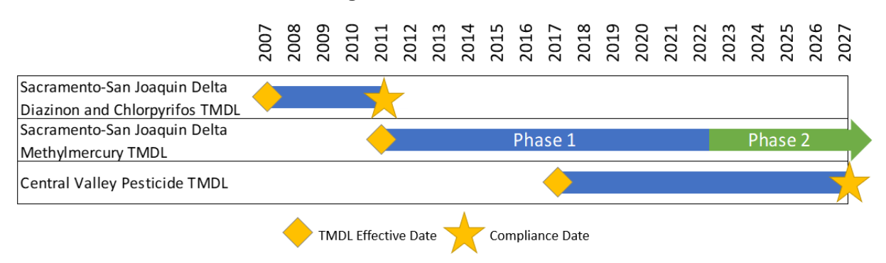
Figure 2. TMDL Schedules

The Central Valley Pesticide TMDL was effective in 2017. The associated Basin Plan Amendment indicates that compliance shall be achieved not later than 10 years from the effective date of the Amendment, in 2027. Table 2 lists SWRP projects that would contribute to meeting the TMDL schedule, provided that they are implemented prior to the compliance deadline.