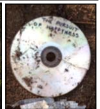
DVD of the movie Pursuit of Happiness was found among the debris...