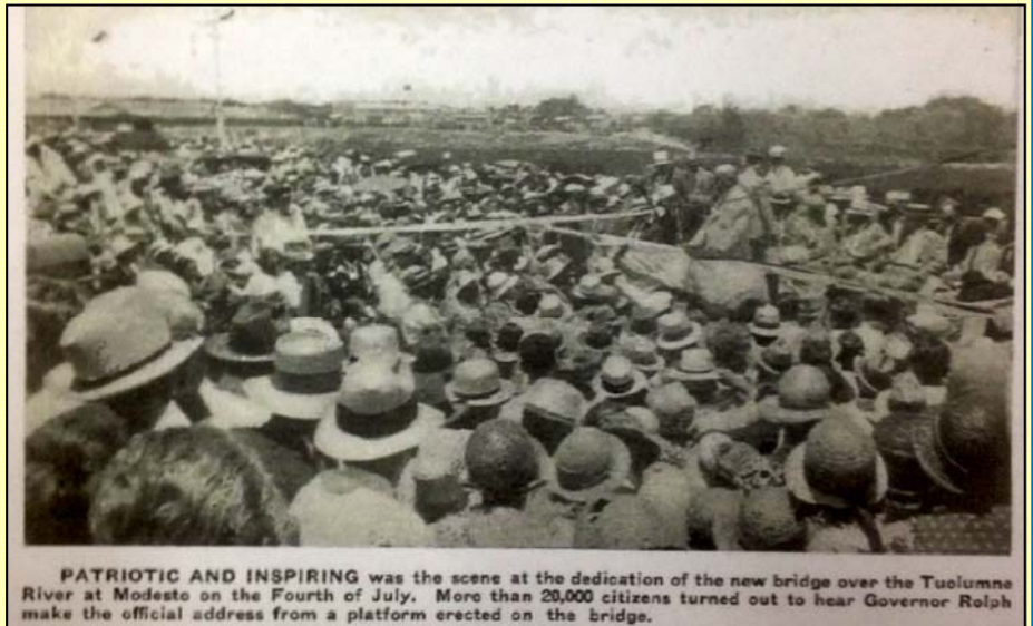
PATRIOTIC AND INSPIRING was the scene at the dedication of the new bridge over the Tuolumne River at Modesto on the Fourth of July. More than 20,000 citizens turned out to hear Governor Rolph make the official address from a platform erected on the bridge.

The dedication ceremony for the 9th Street Bridge was held on July 4, 1933 which was attended by approximately 20,000 people and included a parade and speeches by prominent elected officials. Governor James Rolph, Jr. and two former mayors of Modesto, Sol. P. Elias and L.L. Dennett were speakers at the dedication ceremony (photo on right).