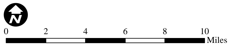
FIGURE 3.1.1.3-1 Parks and Open Spaces within the Vicinity of the Project Area EA: 10-0S8000, Project ID # 1000000263 North County Corridor New State Route 108 Project Stanislaus County, California

Source: ESRI, DigitalGlobe, GeoEye, i-cubed, USDA, USGS, AEX, Getmapping, Aerogrid, IGN, IGP, swisstopo, and the GIS User; 4/27/2016.