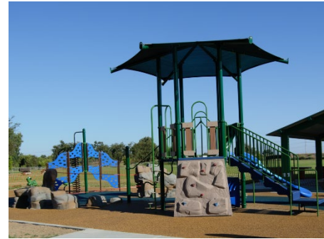
Laird Regional Park Playground (above)

Laird Park is located on Grayson Road (J16) about two miles east of the community of Grayson on the San Joaquin River. The park is approximately 97 acres in size and includes a large picnic shelter with tables and barbecues, baseball/softball area, soccer field, playground, river access and unpaved parking. There are no restrooms at this facility.