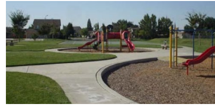
Bonita Ranch Park (Above)

Bonita Ranch Park is located on Lucinda Avenue and 10 th Street on the eastern side of the community of Keyes. The park is approximately seven acres in size and includes picnic tables, basketball court, soccer field, age appropriate play area, drinking fountains, paved pathways and lighting. There are not restrooms at this facility (below).