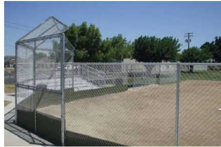
Hatch Park Baseball Field (above)

Hatch Park is located at the end of Jennie Avenue on the eastern side of the community of Keyes. The park is approximately four acres in size and includes a community center, baseball/softball field, parking area and informal play area. For more information regarding the community center, please contact the Police Activities League (PAL) at (209) 529-9121.