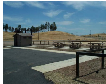
Turlock Lake Fishing Access ( above )

Turlock Lake Fishing Access is located off Lake Road at the inlet of Turlock Lake State Recreation Area. The access is approximately 27 acres with a parking area, ADA accessible restrooms, trails & pathways, and picnic tables. There is no boat ramp at the fishing access. A boat ramp is available at Turlock Lake State Recreation Area.