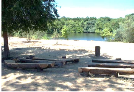
Fox Grove Fishing Access (above)

Access is located on the Tuolumne River at Geer Road. The river access is approximately 64 acres in size on one mile of river frontage with parking area with ADA spaces, restrooms, boat ramp, swimming, picnic tables and fishing. Please refer to the Department of Fish and Wildlife for current fishing regulations. Fishing is prohibited from Nov. 1-Dec. 31 of each year due to the Salmon run.