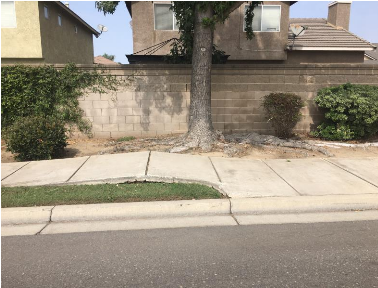
Murphy Tree After –