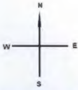
Exhibit 1: Galaxy Way