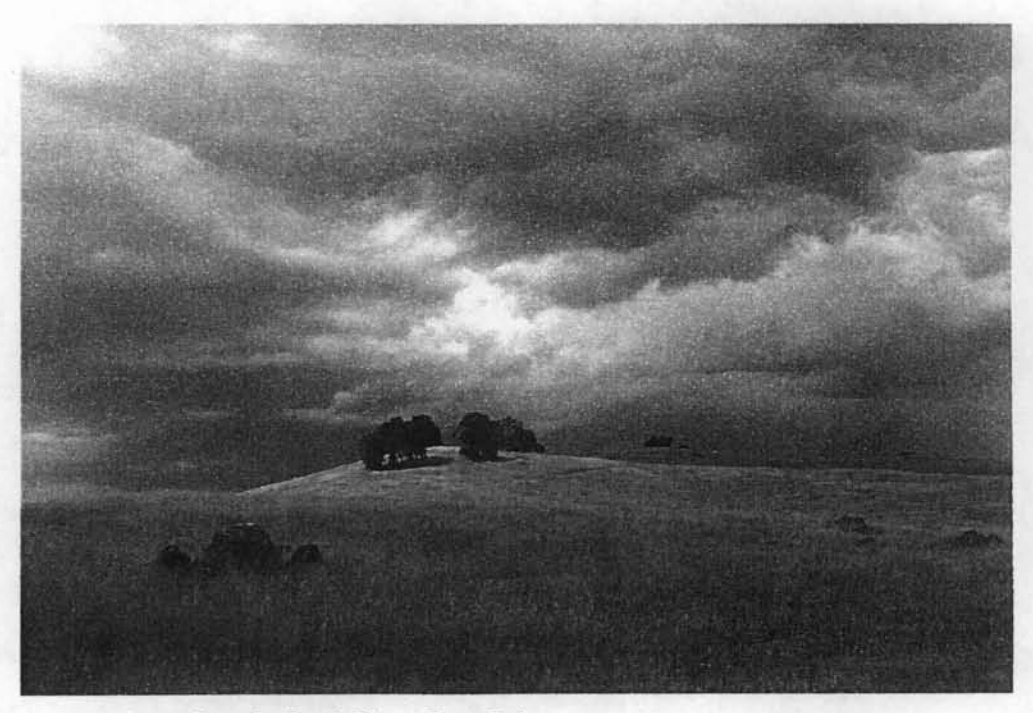
Grassland near Latrobe Road.

The U.S. Fish and Wildlife Service is the principal federal agency responsible for conserving, protecting, and enhancing fish, wildlife, plants and their habitats for the continuing benefit of the American people. The Service manages the 150-million acre National Wildlife Refuge System, which encompasses more than 553 refuges, thousands of small wetlands, and other special management areas. It also operates 66 national fish hatcheries, 64 fishery resource offices, and 78 ecological services field stations. The agency enforces federal wildlife laws, administers the Endangered Species Act, manages migratory bird populations, restores nationally significant fisheries, conserves and restores wildlife habitat.