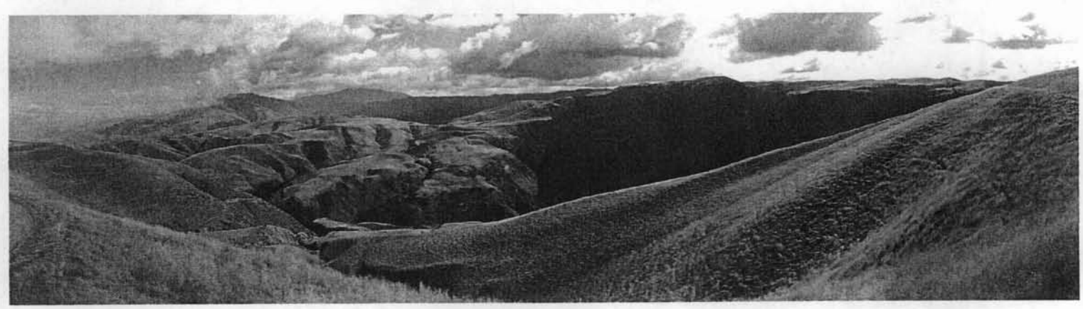
Foothill rangelands.

If established, the CFLA project boundary would define an area where the Service has internal approval to acquire easements. It is Service policy to acquire land only from landowners who are willing sellers. Acquisitions are subject to funding availability.