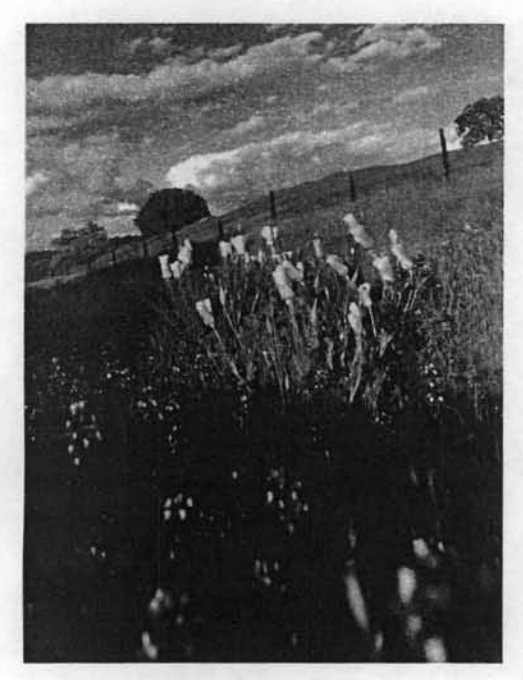
Poppies and lupin.