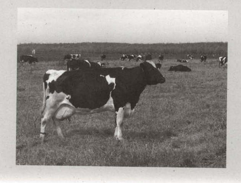
Preserving farms that feed the world.

THE ACCOMPANYING NOTES ARE AN INTEGRAL PART OF THE FINANCIAL STATEMENTS.