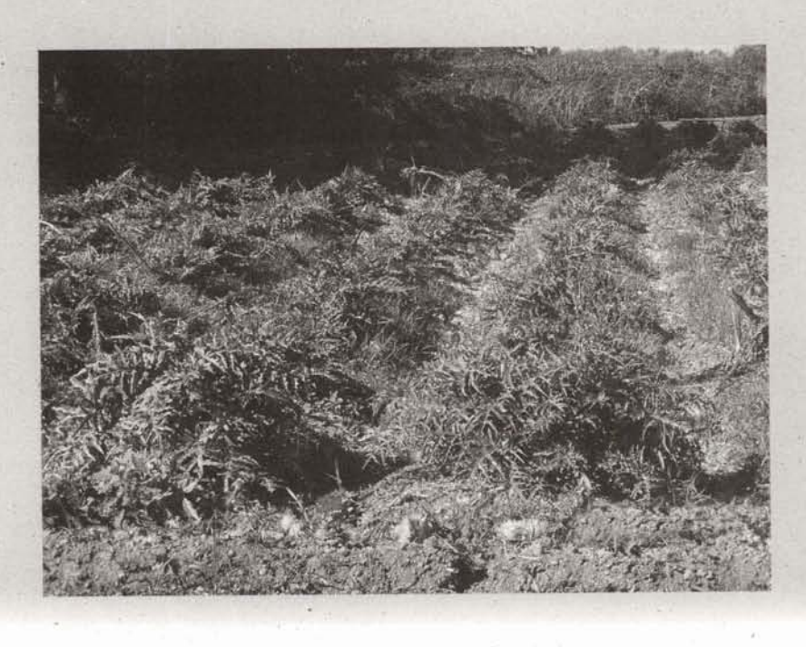
Preserving farms that feed the world.

THE ACCOMPANYING NOTES ARE AN INTEGRAL PART OF THE FINANCIAL STATEMENTS.