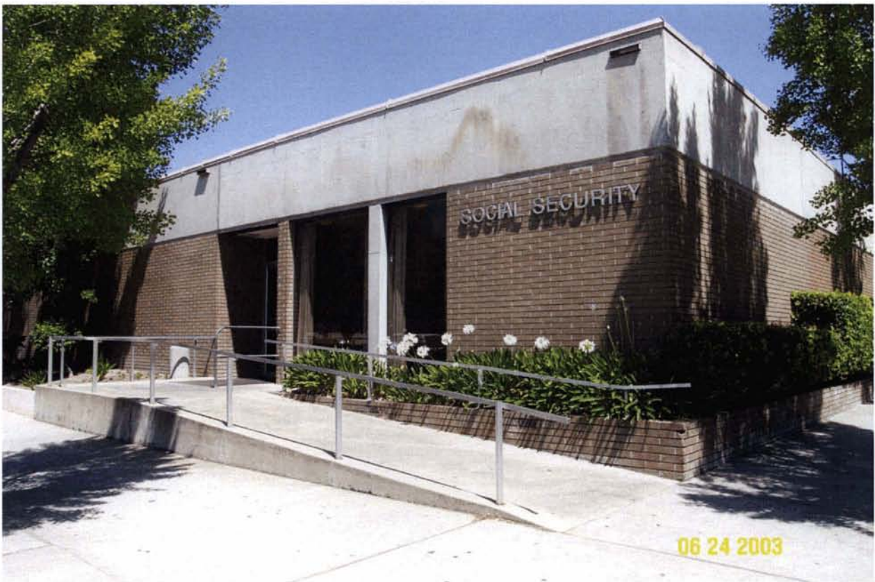
Entrance next to Bus Stop